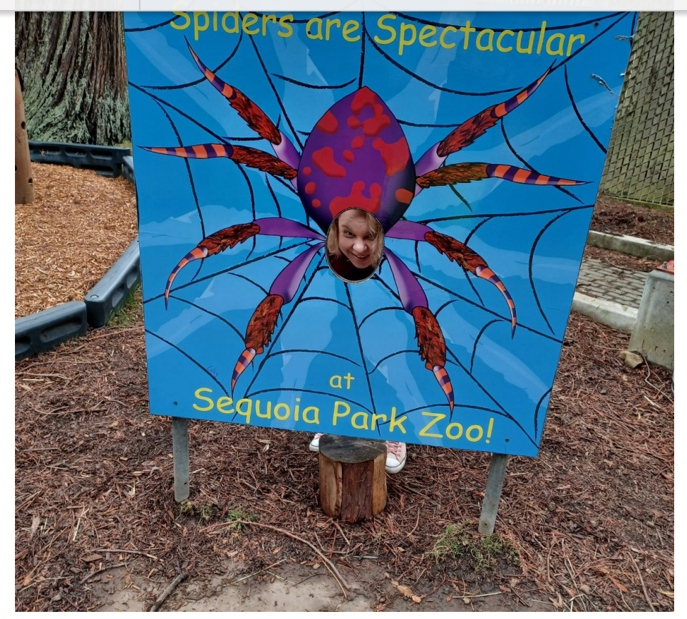
Our Peer support group went to the zoo. We saw all of the beautiful animals and we visited the petting zoo!