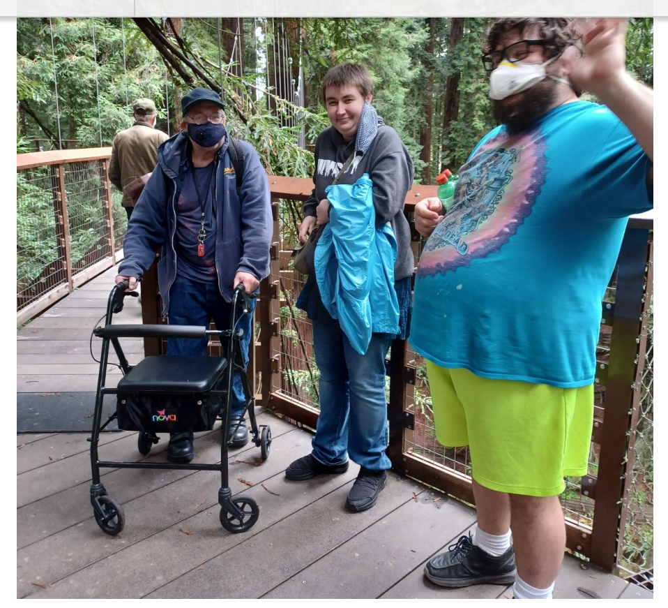
Join Us at our 2022 Independent Living EXPO