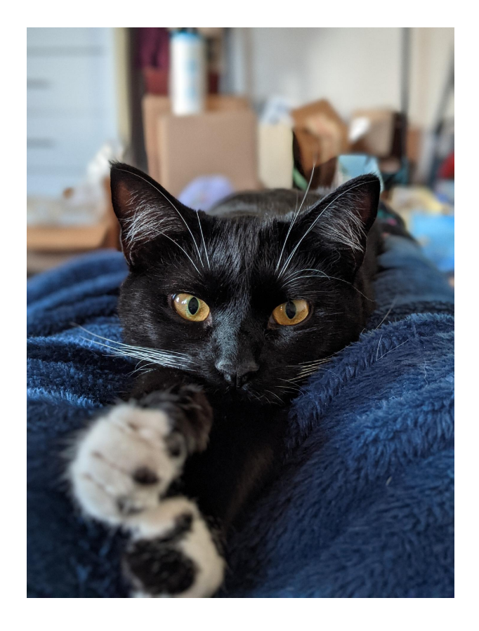
Our Trip to the Sequoia Park Zoo!

They were approved for HUD housing in December and moved into a newly renovated apartment in February 2022 with their beloved cat, Tourmaline. With the most pressing goal of affordable housing reached, we can now focus on their other independent living goals!